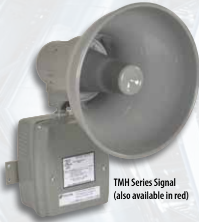
TMH Series Signal (also available in red)

TM/TMH Series signals are high output, continuous-duty tone signaling amplified speakers for industrial applications. They provide high quality signaling in harsh environments and areas with high ambient noise.