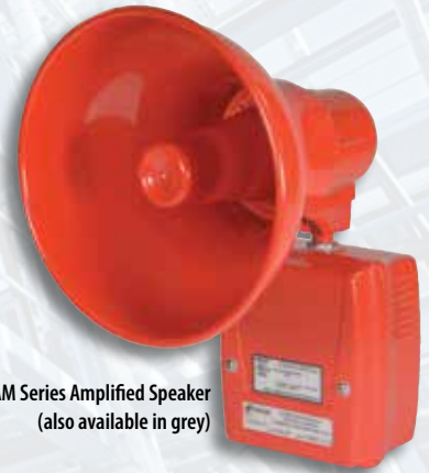
AM Series Amplified Speaker (also available in grey)

AMH Series amplified speakers have the same performance as the AM Series and draw extremely low power while producing audio reproduction up to 107 dBA. In addition, they are designed for use in hazardous areas. They are approved for indoor and outdoor use plus are suitable for NEC Class I, Division 2, Groups A, B, C, and D; Class II, Division 2, Groups F and G; and Class III hazardous areas.