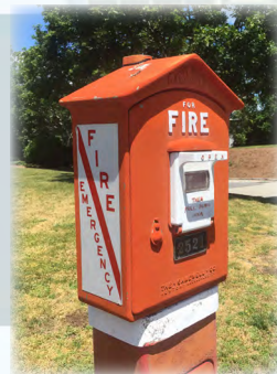
Sigcom Radio Boxes are the ideal replacement for service intensive hardwire connected Master boxes like the one shown here

Sigcom TRX50 system is unique in its ability to enable municipalities and others to cost effectively and safely transition to a modern radio network. TRX50 accepts signals from 100 mA Telegraph Boxes and Sigcom Radio Boxes simultaneously. This facilitates a managed switch over on a flexible schedule. TRX50 gives municipalities a solution for service-intensive legacy fire alarm networks that can be implemented at a reasonable pace and cost to ultimately improve public safety.