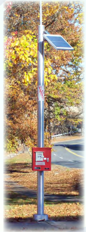
Sigcom DTX Series Solar powered Radio Box can replace City Master boxes virtually anywhere