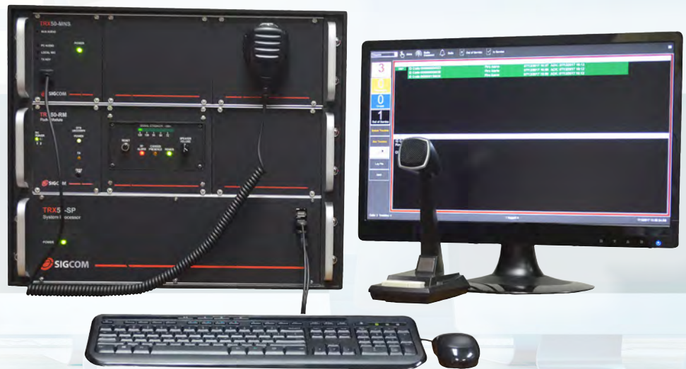
TRX50 System head end including Mass Notification Module with microphone

TRX50's modular platform is also a perfect solution for mass notification to inform and instruct large populations in many buildings, managing dangerous events in real time. The same long range radio system that delivers emergency signals to and from fire and security alarms can also carry live voice to an array of in-building and outdoor appliances and systems as part of an integrated wide area mass notification system. When integrated with Sigcom's MNS-100 mass notification system, TRX50 meets the stringent requirements of UFC 4-021-01.