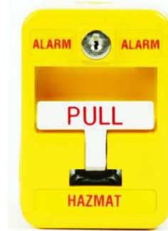
#880-0046-Y and #880-0052-Y