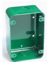
Sheet Metal Back-Box

For BLUE order SG-WP-BL; For Yellow order SG-WP-YL, for GREEN SG-WP-GR