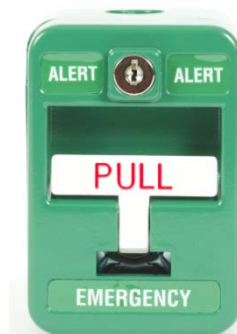
#880-0047-G and #880-0055-G