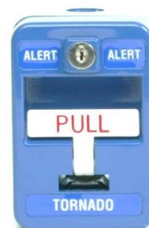
#880-0047-B and #880-0057-B

Other Labels Available, Including Private Branding. Contact SigCom for Details