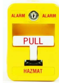
#880-0046-Y and #880-0052-Y