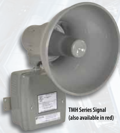
TMH Series Signal (also available in red)

TM/TMH Series signals are high output, continuous-duty tone signaling amplified speakers for industrial applications. They provide high quality signaling in harsh environments and areas with high ambient noise.