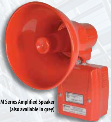
AM Series Amplified Speaker (also available in grey)

AMH Series amplified speakers have the same performance as the AM Series and draw extremely low power while producing audio reproduction up to 107 dBA. In addition, they are designed for use in hazardous areas. They are approved for indoor and outdoor use plus are suitable for NEC Class I, Division 2, Groups A, B, C, and D; Class II, Division 2, Groups F and G; and Class III hazardous areas.