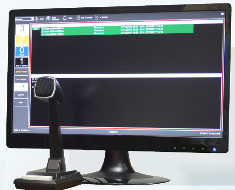
TRX50 System head end including Mass Notification Module with microphone