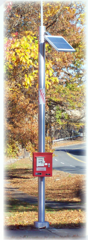
Sigcom DTX Series Solar powered Radio Box can replace City Master boxes virtually anywhere