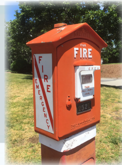
Sigcom Radio Boxes are the ideal replacement for service intensive hardwire connected Master boxes like the one shown here

Sigcom TRX50 system is unique in its ability to enable municipalities and others to cost effectively and safely transition to a modern radio network. TRX50 accepts signals from 100 mA Telegraph Boxes and Sigcom Radio Boxes simultaneously. This facilitates a managed switch over on a flexible schedule. TRX50 gives municipalities a solution for service-intensive legacy fire alarm networks that can be implemented at a reasonable pace and cost to ultimately improve public safety.